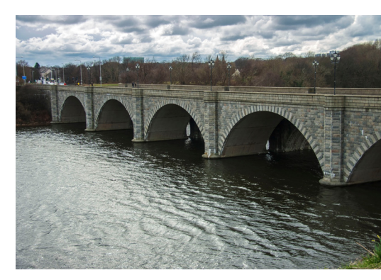
Bridge of Don

16% of tenancy deposit disputes handled by SafeDeposits Scotland in the second quarter of 2023 related to tenancies in Aberdeen City. The biggest source of disputes in the city was cleaning, with 71% of disputes involving a cleaning claim - a little higher than the national average of 62%. At 3%, gardening claims featured least frequently in Aberdeen disputes, while 43% of cases involved damage claims (closely reflecting the national average of 44%), 14% involved redecoration and 11% were a result of rent arrears.